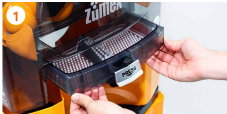
1 Remove the juice container and the cover .

Cover, 1Step Extraction Kit, Juice container, filter and tap