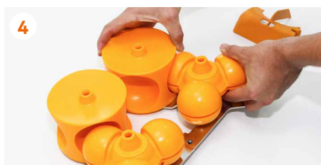
4 Remove the pressing units .