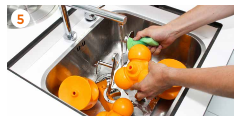
5 Clean all the parts with a sponge and soap, rinse after with clean water. All the parts can also be washed in a dishwasher .