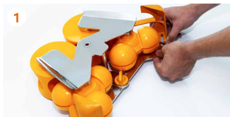
1 Remove the peel ejectors located on the sides at the bottom.

For deep cleaning , disassemble the 1Step Extraction Kit and clean all the parts