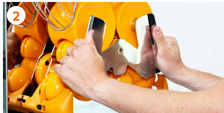
2 Remove 1Step Extraction kit and the blade .