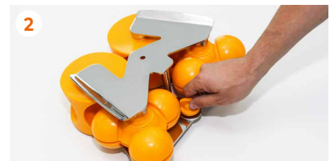
2 Unscrew the knob located on the lower central part.