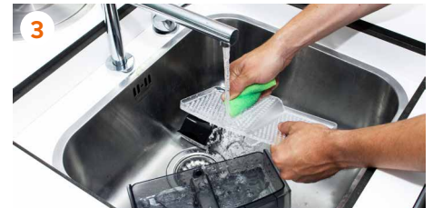
3 Clean piece by piece, by hand or in the dishwasher. *Check the recommendations regarding parts that can be washed in the dishwasher (pag. 2)