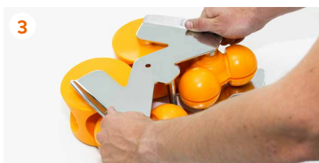
3 Lift the stainless-steel handles .