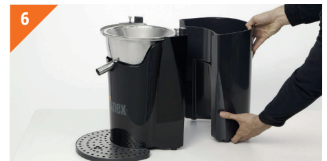
6 Remove waste container by pulling up horizontally.