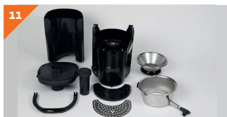
11 Clean parts.