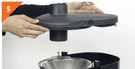
5 Remove top Multifruit lid by lifting upwards.