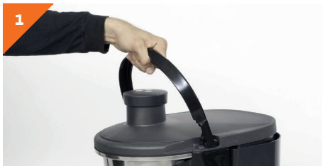
1 Raise security handle.

Zumex recommends cleaning the machine at least once or twice a day , depending on how much it is used in order to maintain optimal food hygiene conditions.