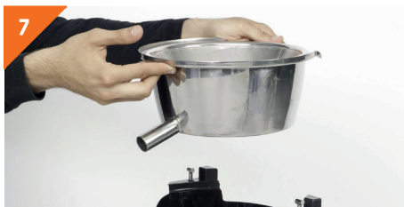
7 Disassemble grating filter and juice tank by pulling upwards.