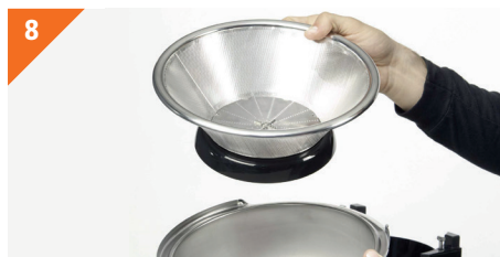
8 Separate filter from filter cover. ATTENTION! Do not touch the sharp points of the grater as they could cut you.