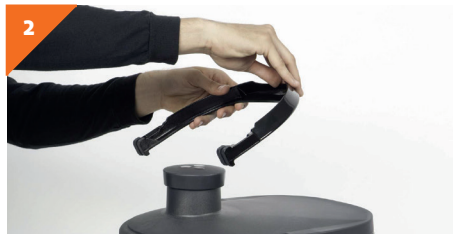
2 Remove security handle by positioning horizontally and pulling handle in the opposite direction.