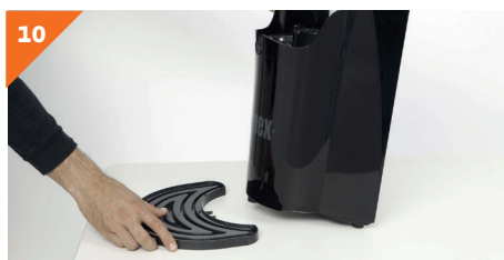
10 Pull out coaster tray.