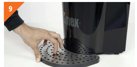
9 Remove coaster from coaster tray by inserting your index finger and pulling out gently.