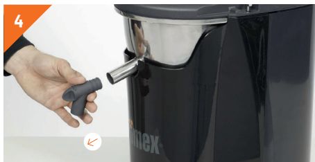
4 Remove tap by pulling out.