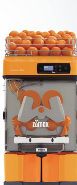
New Versatile Pro