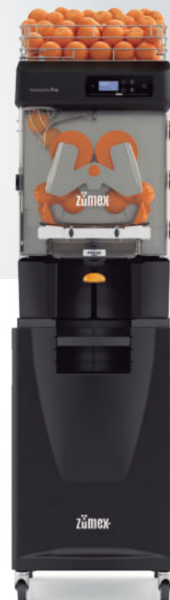
New Versatile Pro All-in-One