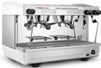
E98 RE A2